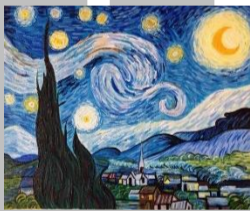
In the Dark of the Night