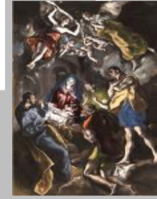
Art & Religion