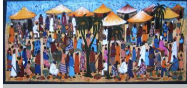
Cultural Tradition in Art