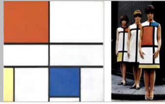
Art in Fashion