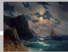
Scenes of the Sea