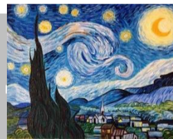
In the Dark of the Night