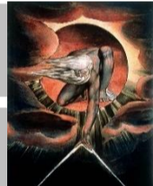
Dreams & Nightmares